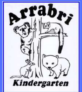
Photo Gallery Term 3